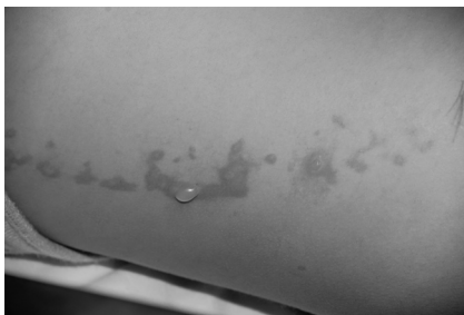
Fig 1. A linear erythematous blistering eruption is noted on the patient's right flank minutes after completion of the MR imaging of her brain and spine.

Note: —ETL indicates echo-train length; ST, section thickness; Sag, sagittal; Cor, coronal; STIR, short tau inversion recovery; TSE2d, turbo spin-echo 2d; TIR2d, turbo inversion recovery 2d; coil elements: H, head; N, neck; S, spine.