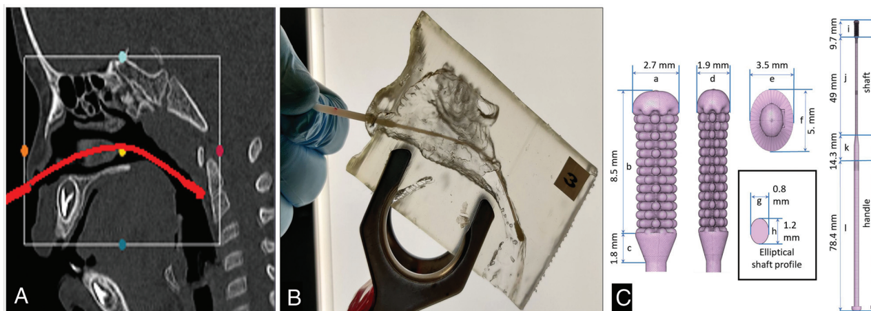
FIG 1. A, Sagittal section of a maxillofacial CT scan of a 22-month-old patient. Shown in red is the trajectory of a virtually inserted swab reaching the posterior nasopharynx. The white box shows the portion of the anatomy chosen to print the nasopharyngeal passage. B, A commercial flocked pediatric swab (COPAN Flock Technologies swab) reaching the posterior nasopharynx within the 3D-printed nasopharyngeal passage. C, Design of the elliptical-section 3D-printed pediatric swab (Design ES).