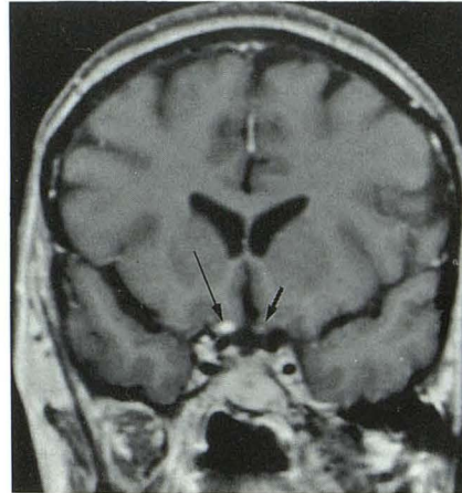
Fig. 2. Coronal enhanced T1-weighted image shows the normal nonenhancing prechiasmatic optic nerve on the left ( short black arrow ) and the enhancing right optic nerve ( long black arrow ).

Two of the patients in this series received chemotherapy prior to the course of RT. Systemic chemo-