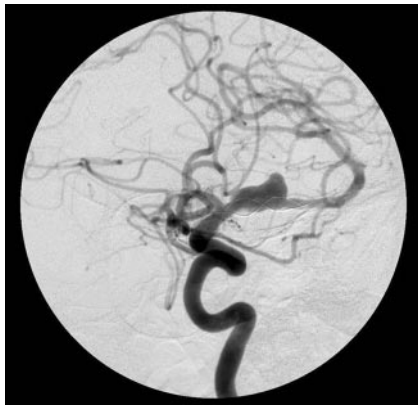
Fig 3. A 6-month follow-up AP angiogram showing decrease in the size of the aneurysm.