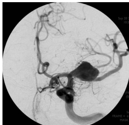
Fig 1. Anteroposterior (AP) digital subtraction angiographic image showing a fusiform aneurysm of the horizontal segment (M1) of the left MCA.

The procedure was well tolerated, and there were no complications. A CT scan performed after the procedure excluded any hemorrhagic complication. The patient was discharged from the hospital 7 days after treatment with no neurologic deficit. A 6-month follow-up angiogram revealed almost complete occlusion of the aneurysm and patency of the left MCA (Fig 3). An angiogram at 1-year follow-up confirmed complete thrombosis of the fusiform aneurysm with preservation of parent vessel patency (Fig 4).