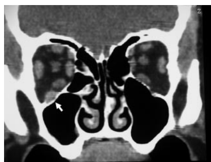
Fig 2. Coronal reconstruction contrast-enhanced CT scan demonstrates enlargement of the right maxillary nerve (arrow).

nant soft-tissue tumors. 2,3 These lesions have a tendency to affect the trunk and extremities, and only 10% of all MPNSTs are located in the head and neck region. 2 The most common nerve affected is the sciatic nerve, followed by the brachial plexus. 2 Between 38%–50% 3,4 of these malignant tumors are associated with NF-1, and this entity is also related to multiplicity. 3,4 The risk for developing an MPNST is 4600 times greater in patients with NF-1 than in the general population. 4